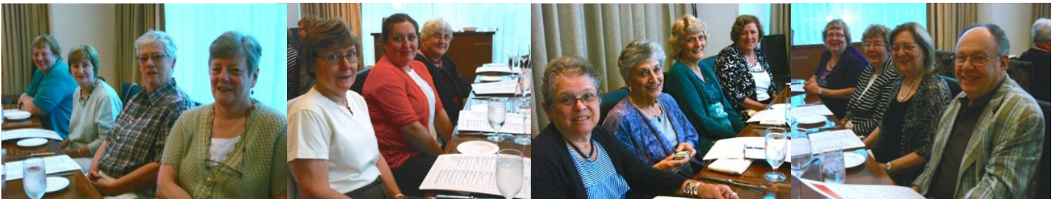
AKS members and guests enjoying CT Night at International Convention